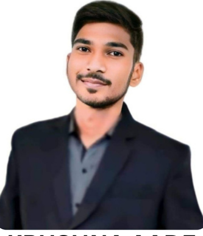
KRUSHNA AADE Silver Pumps 3.5 LPA