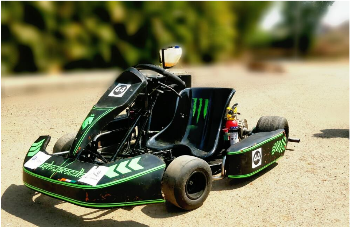
GO-Kart Design and Fabricated by Students