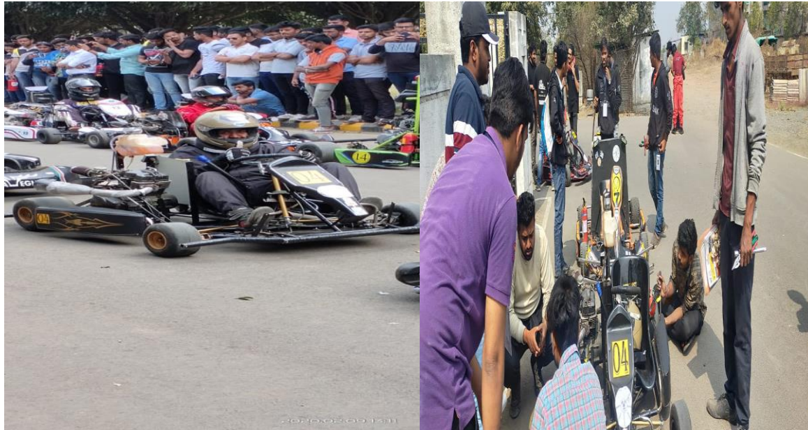
Team Abhyudaya Go-Kart Ready for Dynamic Round and Testing Round