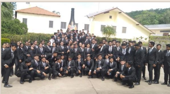
Sula Vineyard Visits