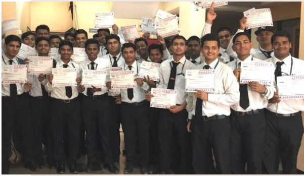
Blood Donation Drive