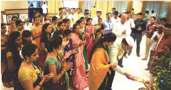
Ganapati Festival and Alumni Meet