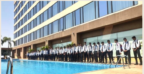
Industrial Visit to Hotel