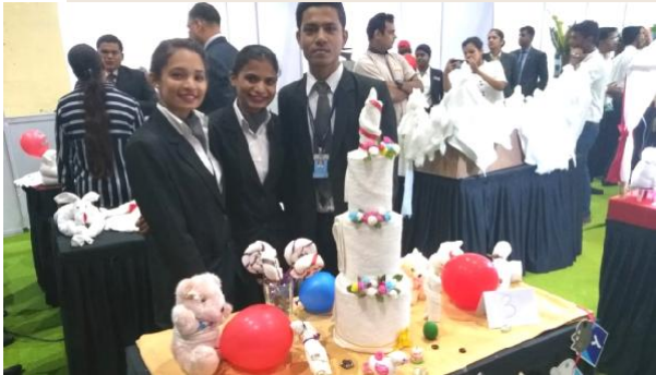
Linen Origami Competition