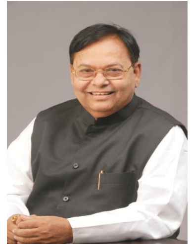
Hon'ble Dr Patangrao Kadam Founder Bharati Vidyapeeth