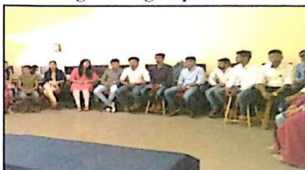
At Civil Engineering Department