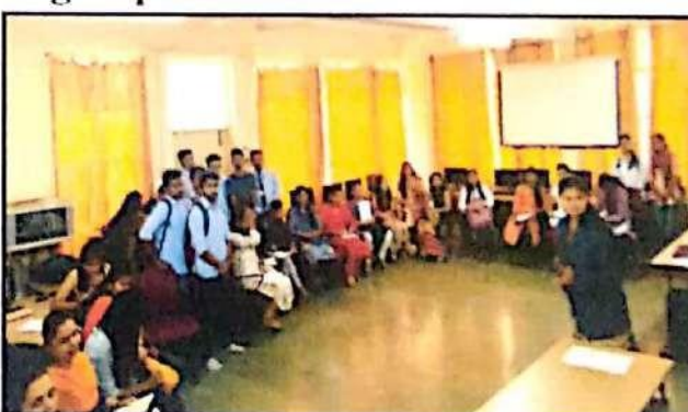
At Computer Science and Engineering Department