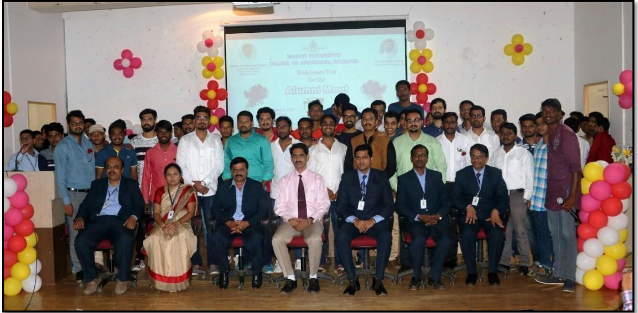
Alumni Meet Photo 2017