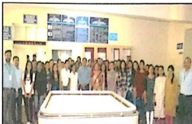
At Electronics & Telecommunication Engineering Department