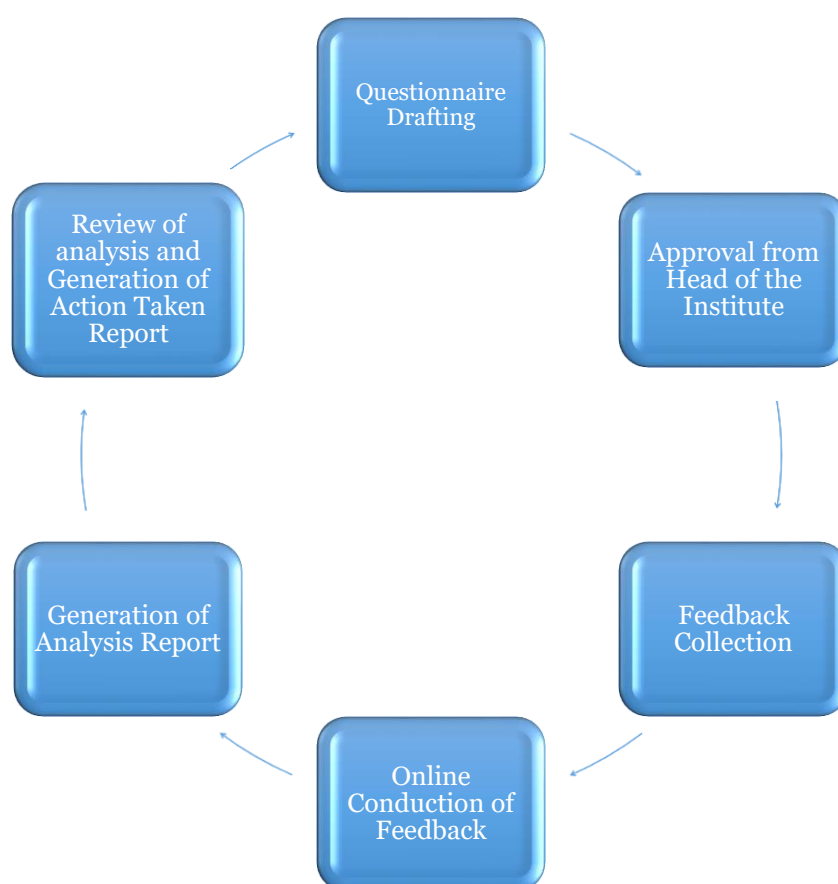
Fig. 1: Feedback Process

The Institute is committed to maintaining a robust feedback mechanism involving various stakeholders. The centralized feedback committee collects online feedback from students, teachers, parents, alumni, and employers to enhance the overall development of the institution. The feedback process is designed to ensure continuous improvement in academic and administrative functions.