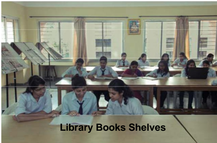
Library Books Shelves