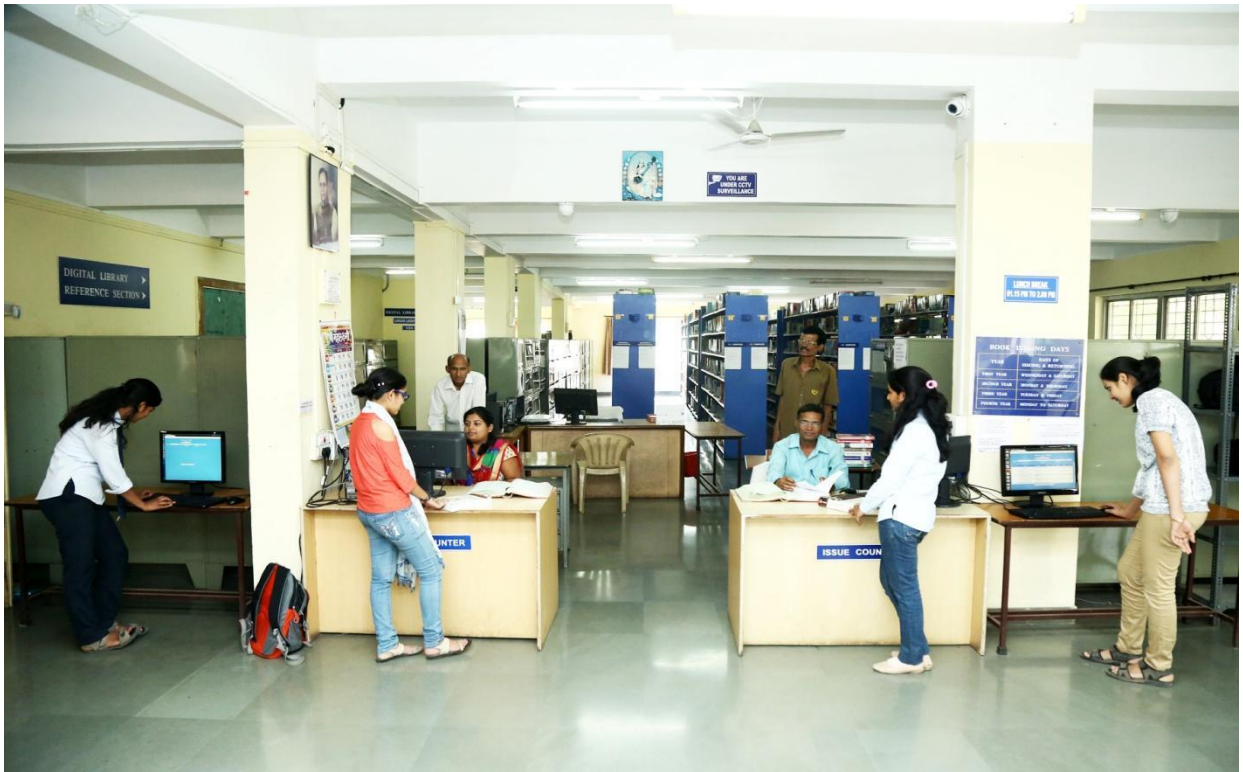
Book(s) Circulation Counter & SOUL 2.0 WEB OPAC ON URL: 172.16.84.27/webopac