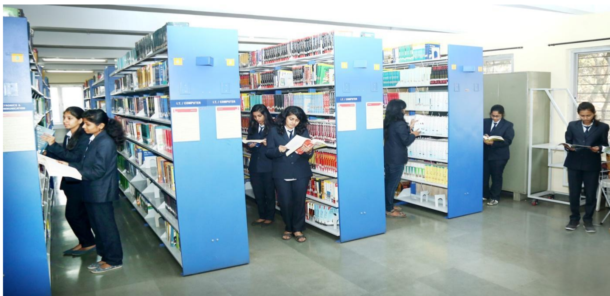
Library Book Shelves