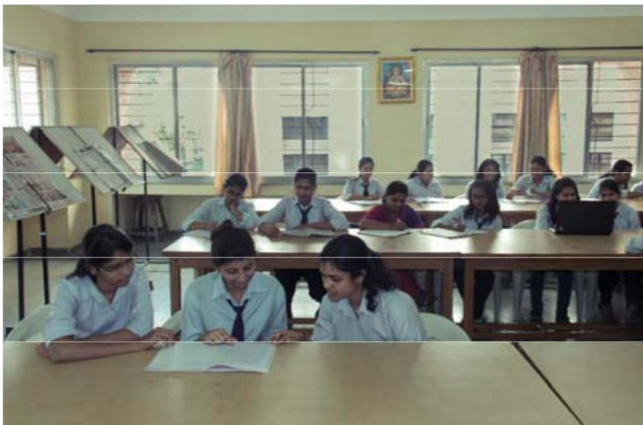
Library Reading Hall