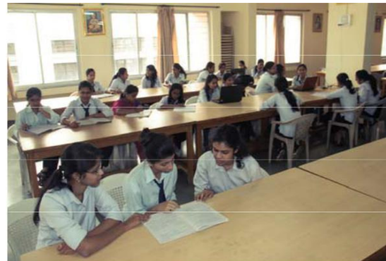
Library Books Shelves