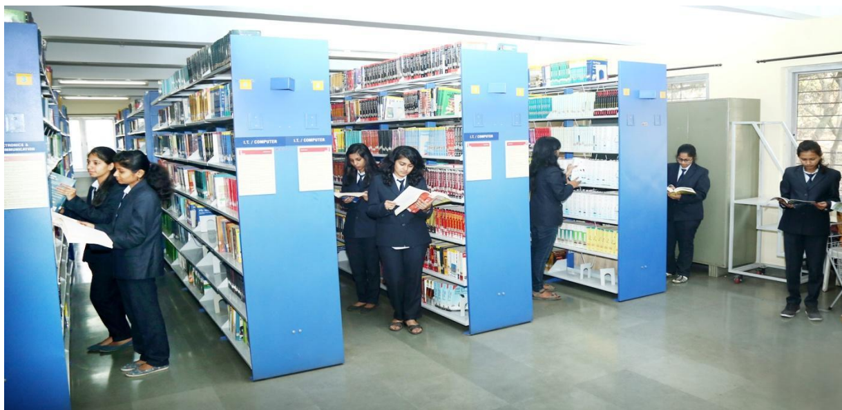
Library Book Shelves