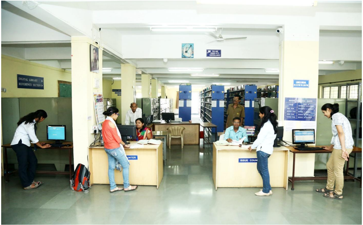
Book(s) Circulation Counter & SOUL 2.0 WEB OPAC ON URL: 172.16.84.27/webopac