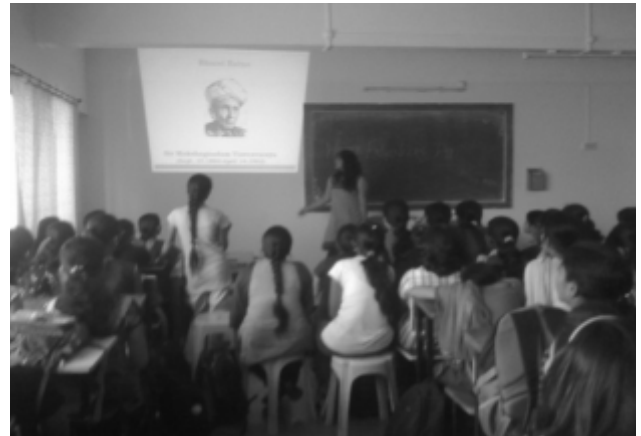
Celebrating ENGG.'s Day