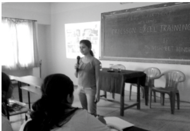
Workshop Conducted by Sony Ericsson