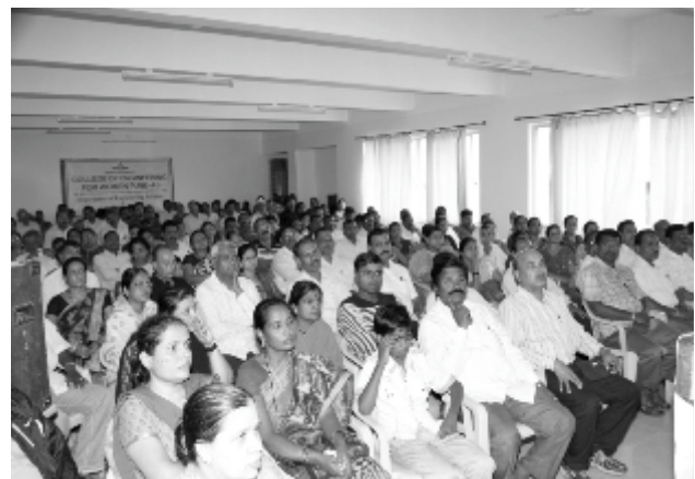
About 200 parents attended the meet