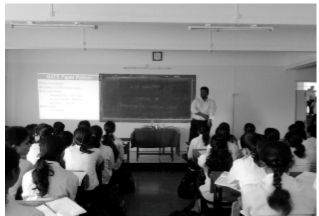
Seminar Conducted by Gate Academy