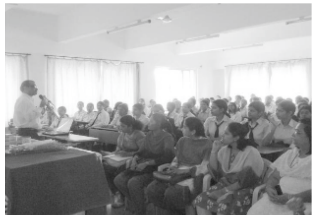
IEI Paper Presentation