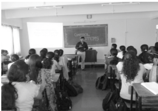
Expert Lecture on Control System