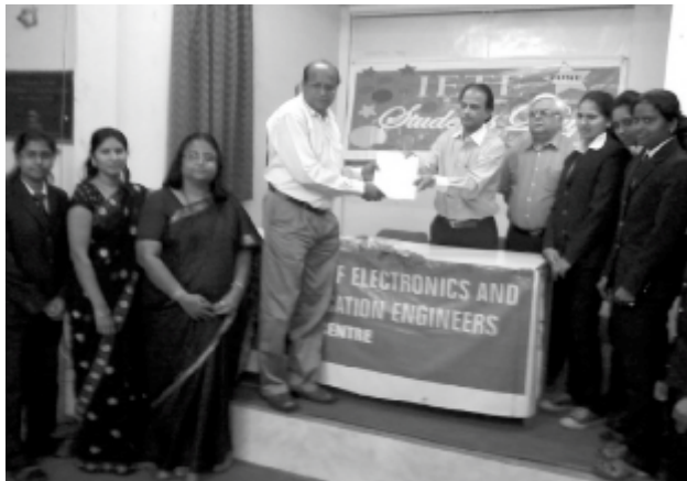
Award winning ceremony of IETE event, Pune

IETE STUDENTS FORUM started on 6th Oct 2006 and has till date conducted more than 50 events in our college which includes project exhibition, workshop, seminars etc. It has helped students to enhance their academic as well as interpersonal skills developing all aspects of their personality thus providing a platform for them to stand out in crowd. IETE student chapter of E&TC department is consistently winning various prizes since 2006 from its inception by IETE Pune center for conduction of best ISF activities.