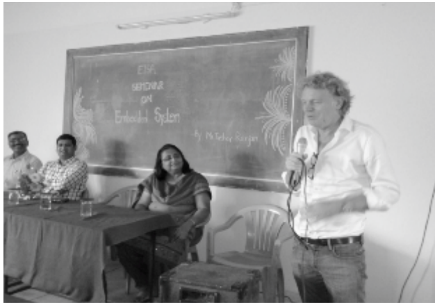
Expert Lecture on Embedded System