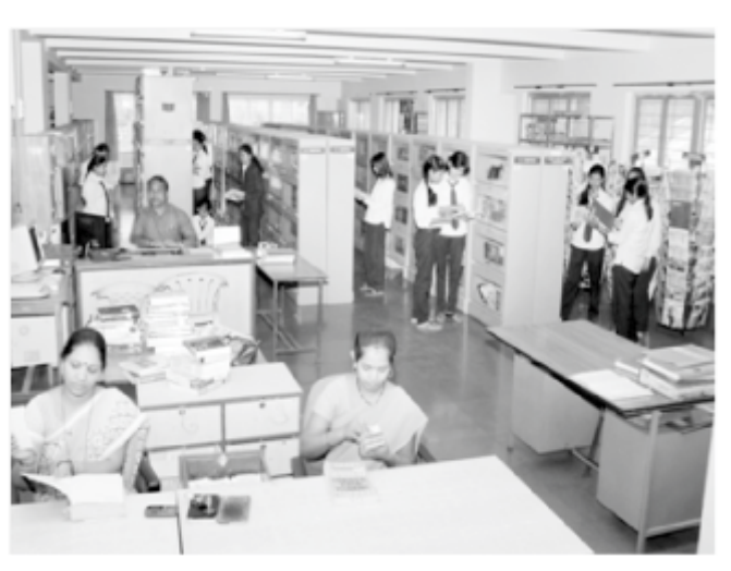
Borrow and Issue Section