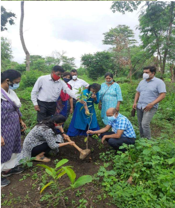
BVCOEW staff and students planting trees at taljai tekdi on 12th august 2022