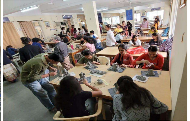
BVCOEW students conducted ganesh idol making activity on occasion of ganesh chaturti on 27th august 2022 at college.