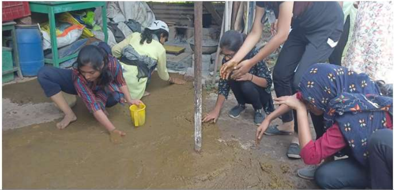
BVCOEW students while helping villager womens in their village cleaning from 23rd feb to 1st march 2023 at shriramnagar.