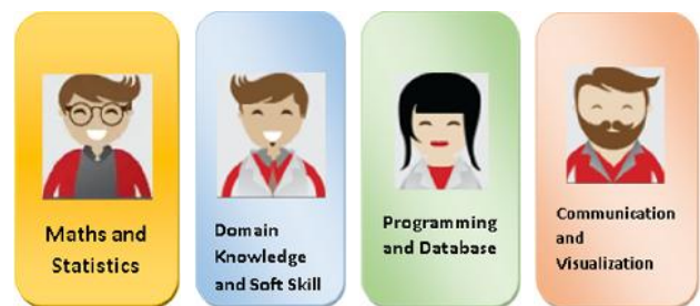
Fig 2. Skill Set

By definition, Data Scientist is an analytical professional who is responsible for collecting, analyzing and interpreting data to help drive decision-making in an organization. He/she can build machine learning models, scale the efforts at large level, leverage the software engineering skills and common programming languages such as R and Python to optimize a program or to conduct more statistical inference and data visualization.