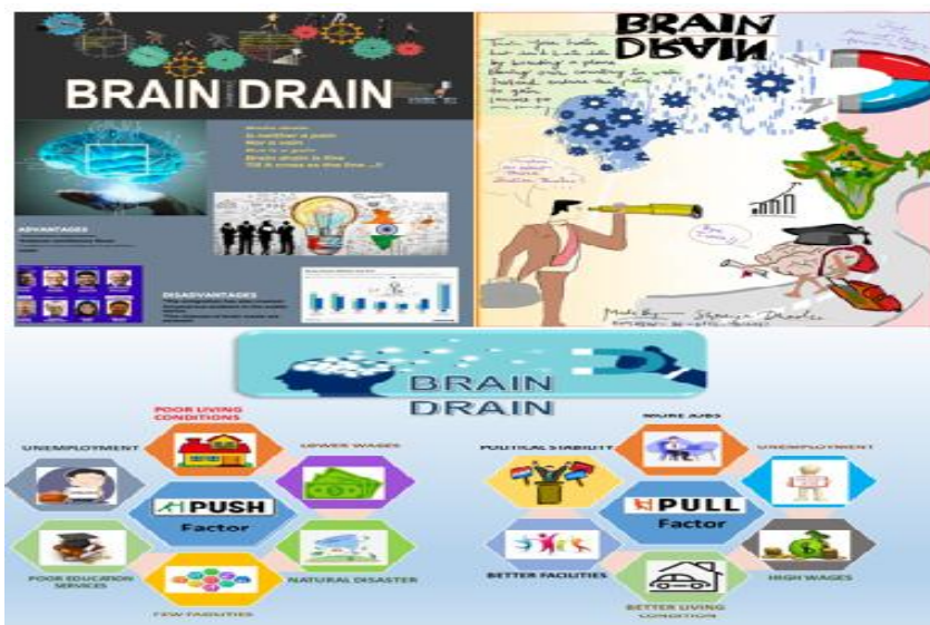
Winning Posters of the Event