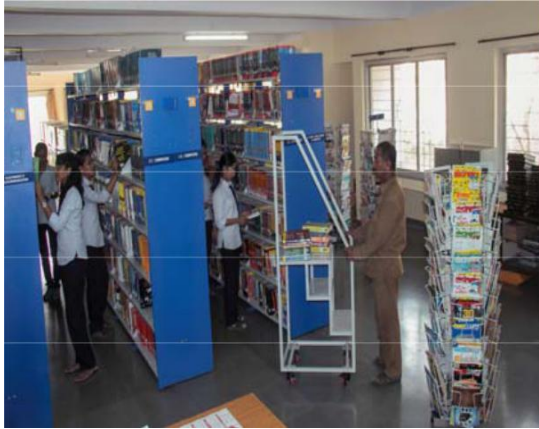
Library Book Shelves