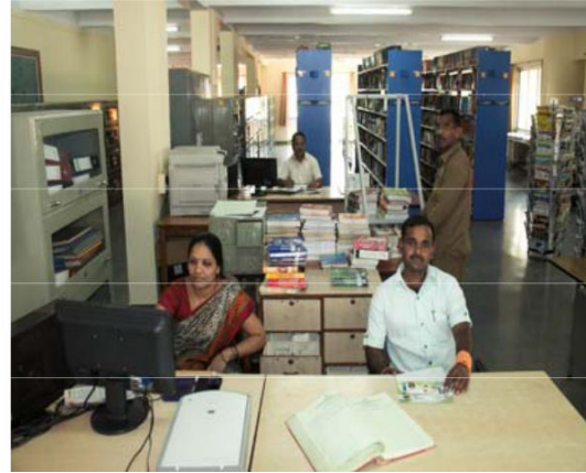
Library Book Issue Counter