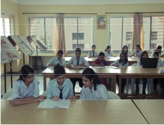
Library Reading Hall