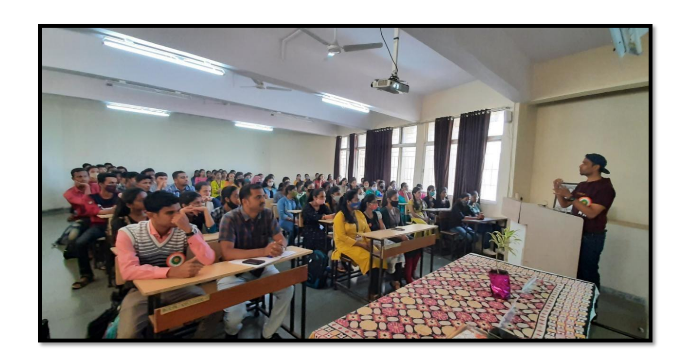
One Day Workshop on "Industry Awareness Programme"