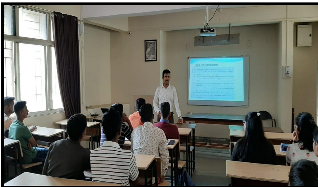
Guest speaker to guid final year students regarding communications skills