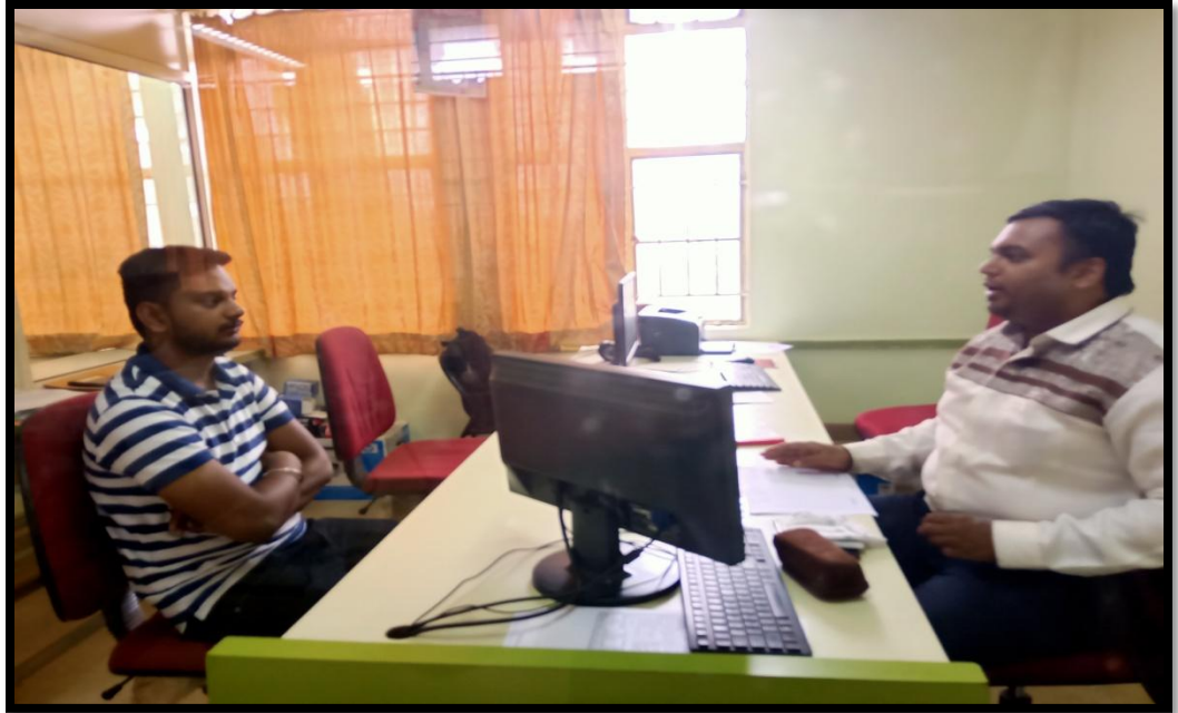
Mock Interview Sessions