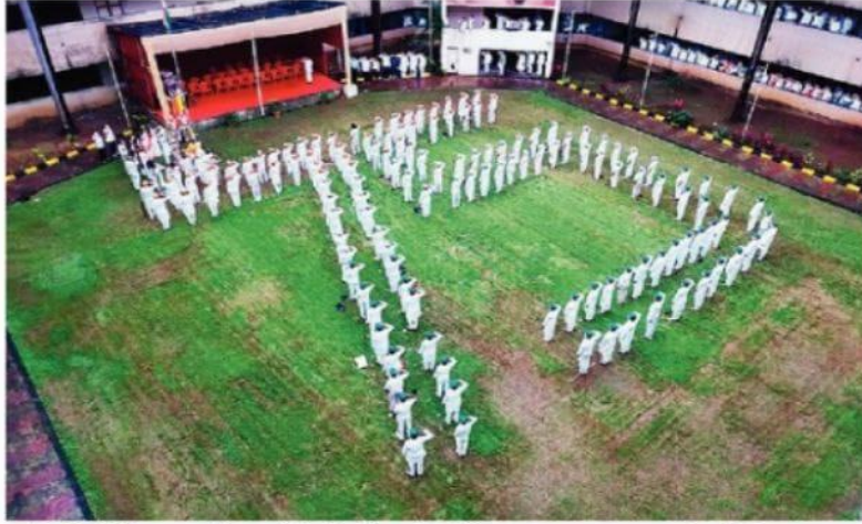
स्वातंत्र्य दिनानिमित्त खाद्यरमधील भारती विद्यापीठातील कर्मचाऱ्यांनी ७५ असा आकडा करून मानवंदना दिली.