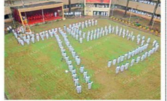
पनवेल : खारघरमधील अनियात्रिकीच्या विद्यार्थ्यांनी मानवी साखळी तयार केली.